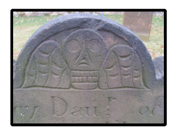
B) Winged Skull

Often used on the gravestones of ministers, clergyman, or devoted religious people. It represents a person's good deeds and accomplishments.