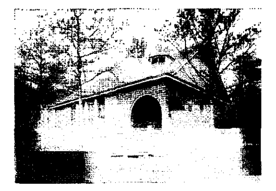
(The Eisenberg home at 119 Cypress St., when it was the Wyoming school)